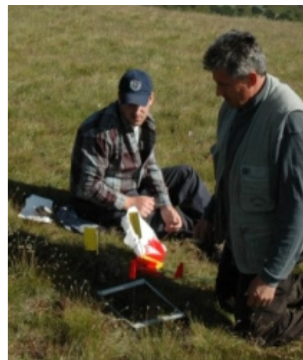
Image right: Researchers evaluate plant growth near Mount Salatin in the Western Tatra Mountains.

Baron, who participated in the data analysis and interpretation, has investigated the impacts of nitrogen deposition in Rocky Mountain National Park for 26 years. Her research supported establishment of nitrogen thresholds for the park in 2006, the nation's first critical load of a pollutant to protect a national park environment.